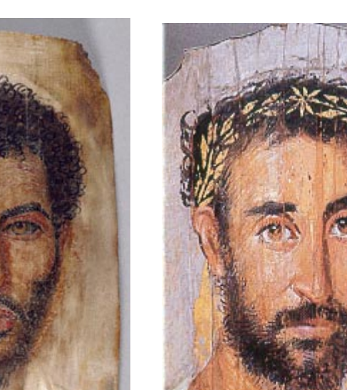
Fig. 3 Portrait of a bearded man, said to be from er-Rubayat, c. AD 150–170 (Malibu, Getty Museum 74.AP.11).