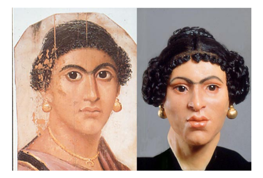
Fig. 8 Portrait of a woman, from Hawara, AD 55–70 (British Museum EA 74713), and a reconstruction of her face.

in the first instance purely on the evidence of the skull, and it is the proportions of the skull that dictate the shape of the face that overlies it. Superficial detail such as hair can be added afterwards from secondary sources like the panel 'portrait', but only once the basic reconstruction has confirmed that portrait is indeed of the person on whose mummy it has been placed. This is not always the case–in some instances even the sex of the individual is wrong, so there can be no question of the 'portrait' having been painted some years in advance and the individual's appearance having changed over the years. However, in the case of the two Hawara mummies the match is sure. If one sets EA 74718's portrait beside his reconstruction there are some significant differences: although the mouths tally, the