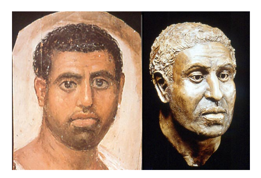
Fig. 7 Portrait of a man, from Hawara, AD 80–100 (British Museum EA 74718), and a reconstruction of his face.