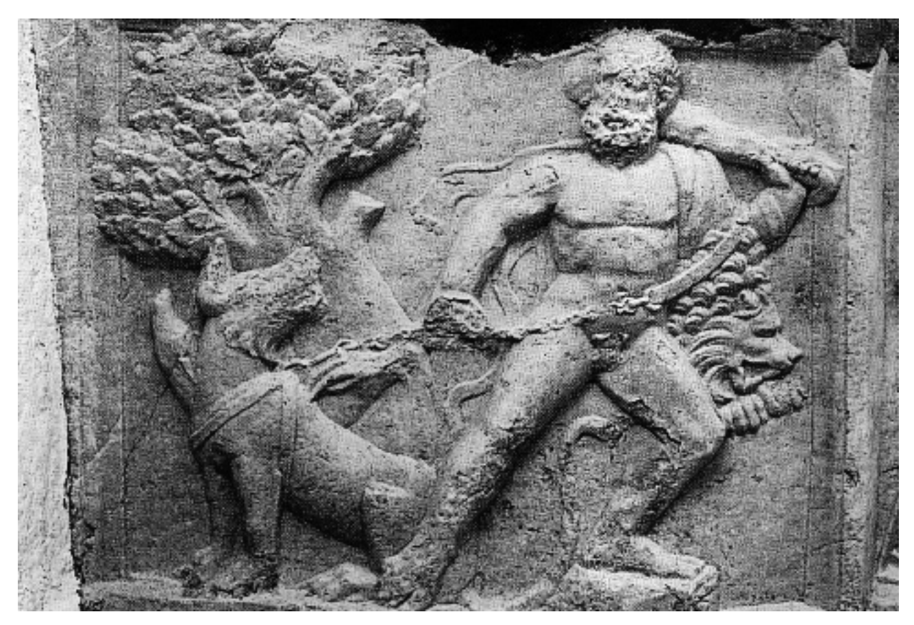
FIG. 4 RELIEF OF HERACLES WITH CERBERUS.

other side of the town, in the south east part, where there was a watercourse in ancient times, in the ruins of the Church of St John in the Arsenal, another altar dedicated to Heracles has been discovered (today part of the Uljanik wall). In the Pula ager , by the natural pool of the lake at Bale, where there was a complex of shrines, a statue of Heracles has been discovered. It is very likely that Heracles was worshipped in nature here too, as was the case not far from the Heracles Gate in Pula. In Aquae lassae (Varaždinske toplice) where the ancient hot springs have been kept working right until the present day, another altar dedicated to Heracles has