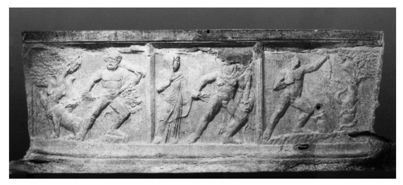
FIG. 3 THE RELIEFS OF HERACLES IN THE CHURCH OF ST CAIUS IN SOLIN.

on Sicily at Megara and Chimera after his battle with Geryon (Schol. Pind.O.12, 27). Bathed by Nymphe in the warm springs of Hyllos and Achesion, Heracles was healed, and gave their names to his two sons. Baths and drinking springs were given to Heracles by Nymphe. A source in Troezen was discovered by Heracles and hence bears his name (Paus. 2, 32, 4), while baths in Thermopylae were dedicated to him (Strabon 9, 4, 13). In Spain, Eritria, some identify him with the island of Leon, where the most ancient city of Gades was located, on the eastern cape there was a temple of Heracles famed because of a spring that dried up when there was a high tide and came out at low tide. Heracles had a spring in Caere (Liv. 22, I, 10) and hot springs in Allifa and in Mehadia (fontibus calidis). It has been shown that in Vichy, where there are warm water springs, aquae calidae, there was a cult of Heracles the healer. The well-known shrine to Heracles in Deneuvre stands out for its highly original design. Alongside the pools that are linked by a path there are monuments with figural presentations of Heracles, about a hundred of them